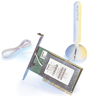
PCI Card with External Antenna